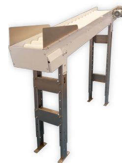
Wave belt elevator

If you'd like to find out more or to discuss your specific packhouse requirements, please visit www.sienz.com