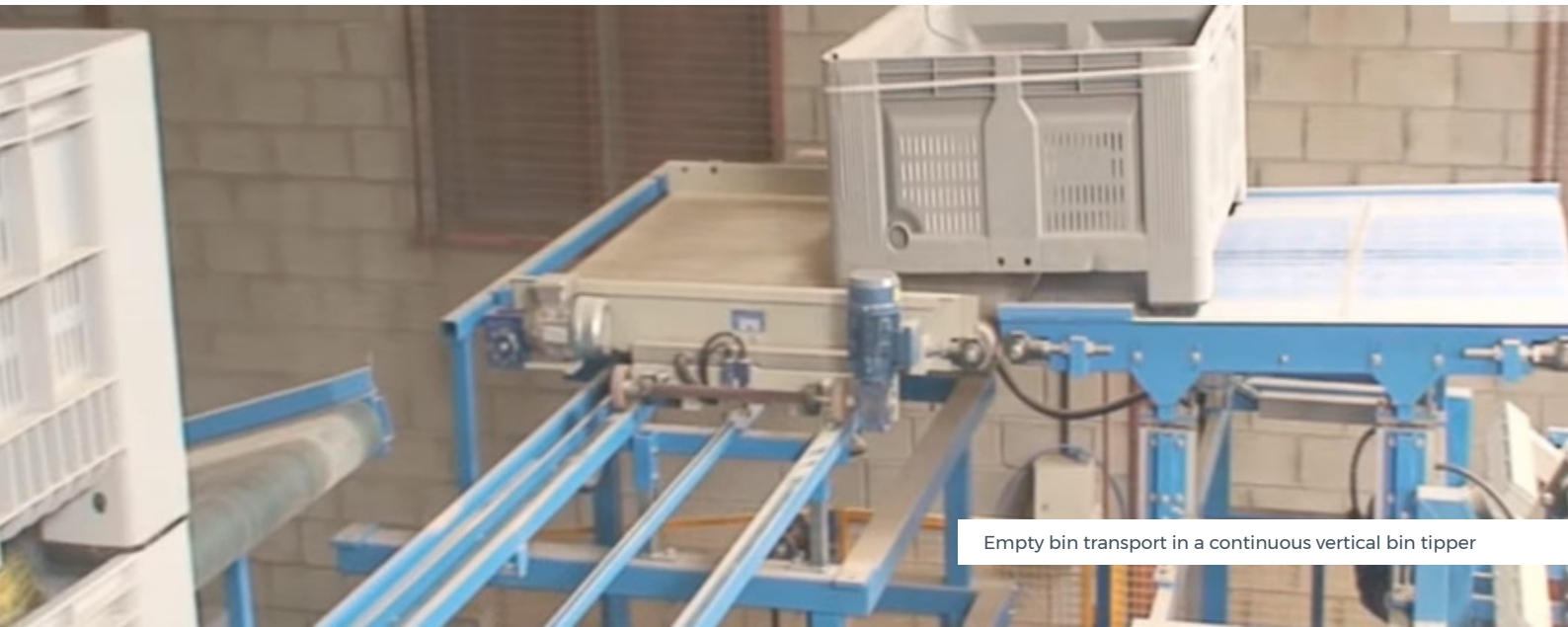
Empty bin transport in a continuous vertical bin tipper