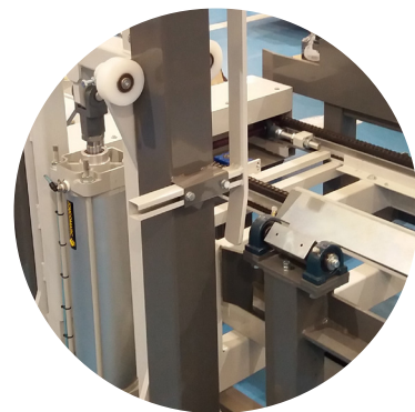
Detail of empty pallet or bin stacker