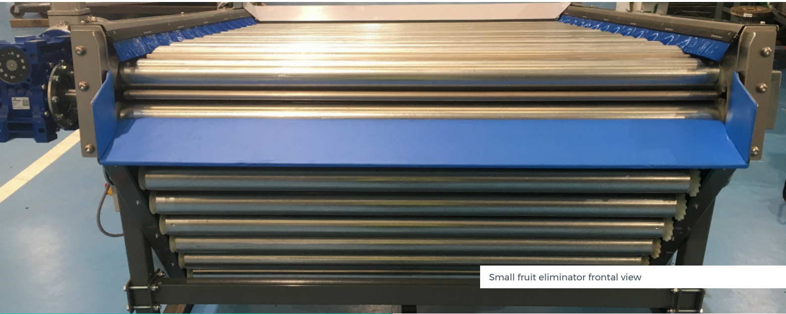
Small fruit eliminator frontal view