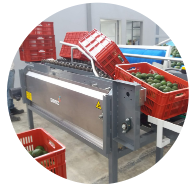
Twist chain dumper in operation