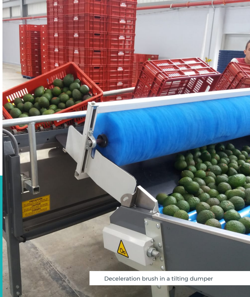
Deceleration brush in a tilting dumper